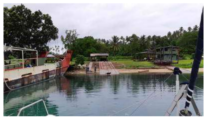
Approaching the ramp with trolley down. The hauling winch house straight ahead