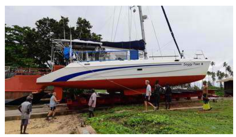
Fully Out! Noel is in shorts at the rudder

Because we opted to just sit on our keels, rather than on Noel's strong frame that would allow lifting under the bridge deck, we stayed at a minor tilt during our haulout. But if you haul out using Noel's frame, it is angled a little bit so that you end up with the boat level. Noel has, or can build, whatever structure you need to make sure your boat sits on its strongest part for the haulout.