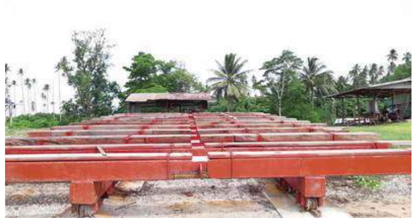
The 200 ton trolley- about 24' wide but extendable