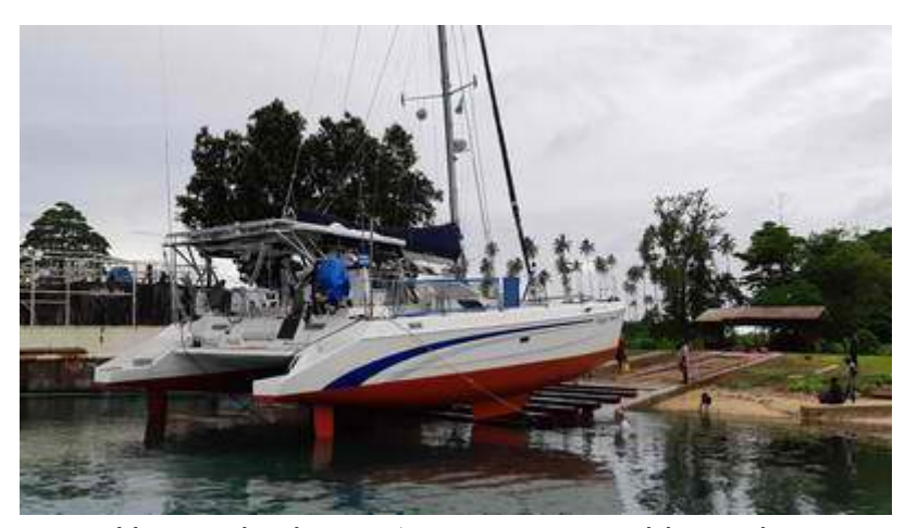
Up we slowly go at a very reasonable angle.