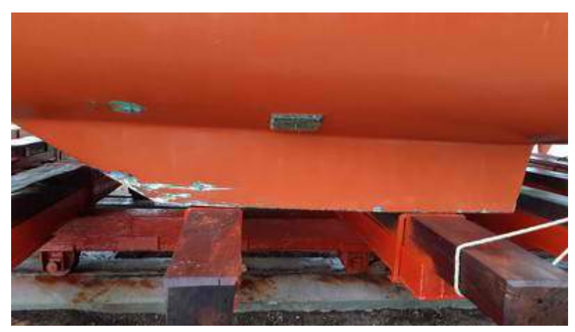
Oops, just a small scrape! Unknown person at the helm.

Because we opted to just sit on our keels, rather than on Noel's strong frame that would allow lifting under the bridge deck, we stayed at a minor tilt during our haulout. But if you haul out using Noel's frame, it is angled a little bit so that you end up with the boat level. Noel has, or can build, whatever structure you need to make sure your boat sits on its strongest part for the haulout.