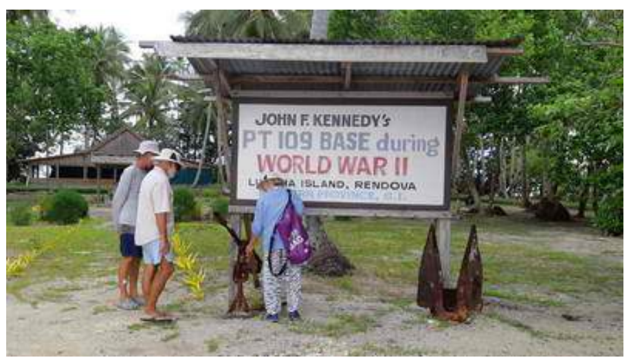
PT Boat Base sign and a couple of WWII relics.