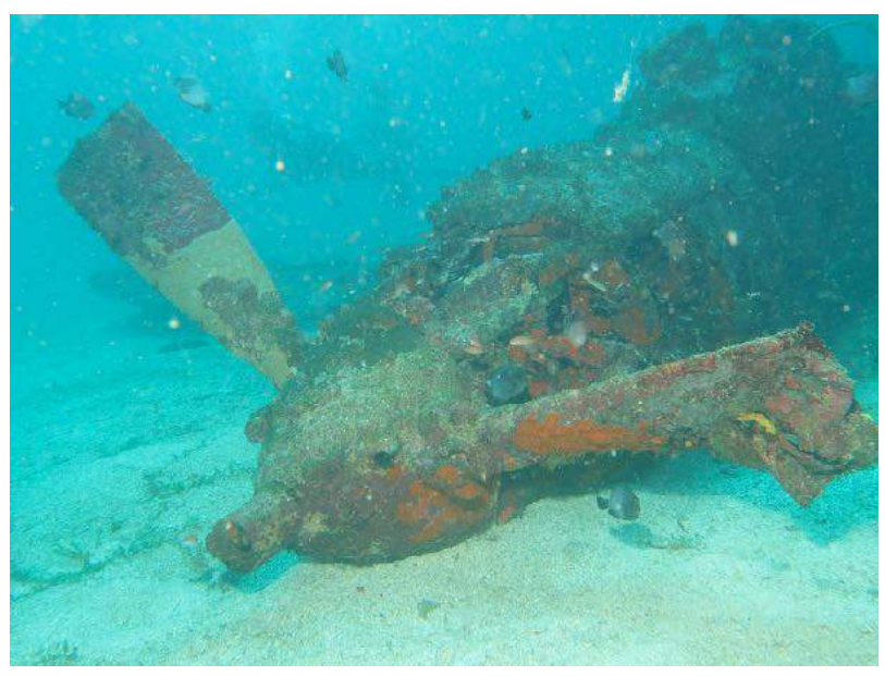
The front of the P-39 shows the prop and 37 mm cannon with its barrel extending through the center of the prop and engine almost back to the cockpit.