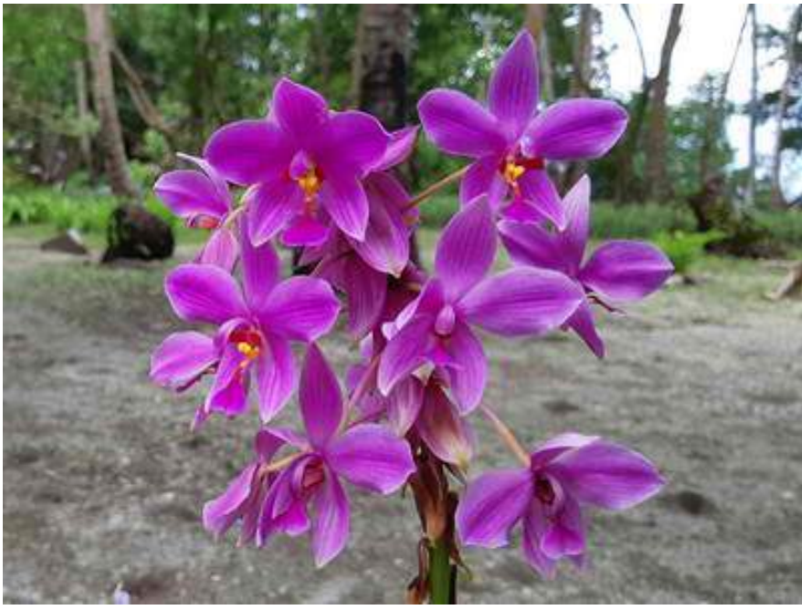
Lovely orchids on Luberia Island grounds

As we got ready to raise anchor to move to another anchorage, the kids came back! Liz generously handed out cookies in exchange for photos of the kids in their canoes.