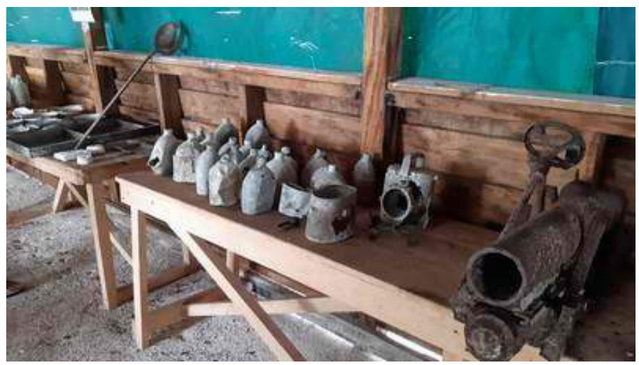
Canteens, mostly US, battle lantern, mess kits and a possible mortar barrel.