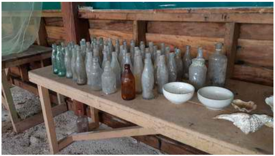
US Coke & beer bottles & bowls. During the war green Coke bottles were continental US made, clear are made overseas.

For someone who wants to visit the museum that doesn't have their own boat, the best way is to go to the Agnes Hotel (<u>https://www.agneshotelsolomon.com</u>) or Dive Munda (<u>http://www.divemunda.com</u>), in Munda, and take a day trip over with them.