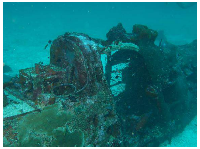
The P-39 resting on the sand with its cockpit to the right