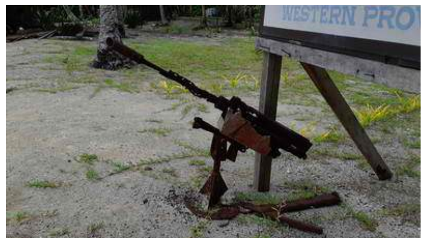
A 30 caliber machine gun.