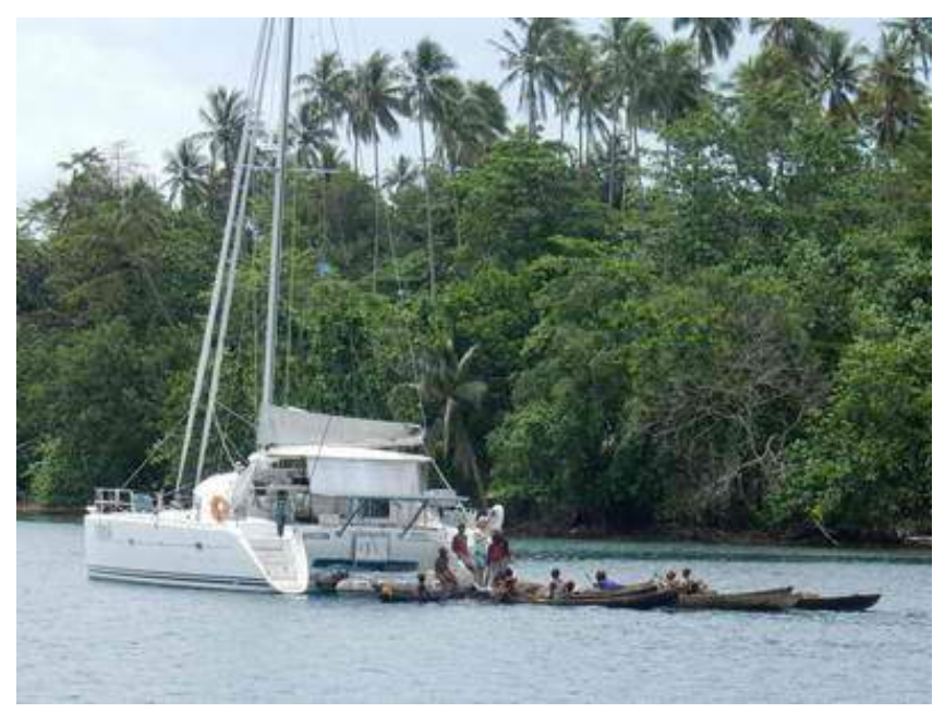
The kids in their canoes getting cookies from Indigo

As we got ready to raise anchor to move to another anchorage, the kids came back! Liz generously handed out cookies in exchange for photos of the kids in their canoes.