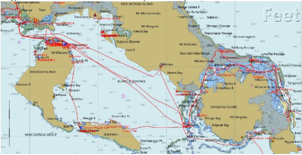
Blanche Channel, with our multiple tracks from Munda (upper left), Rendova, Tetepare and New Georgia Islands, to Morovo Lagoon right.

under the Destinations menu on the SSCA website or on our own website, now has waypoints and information on most of the possible stops in the Solomons.