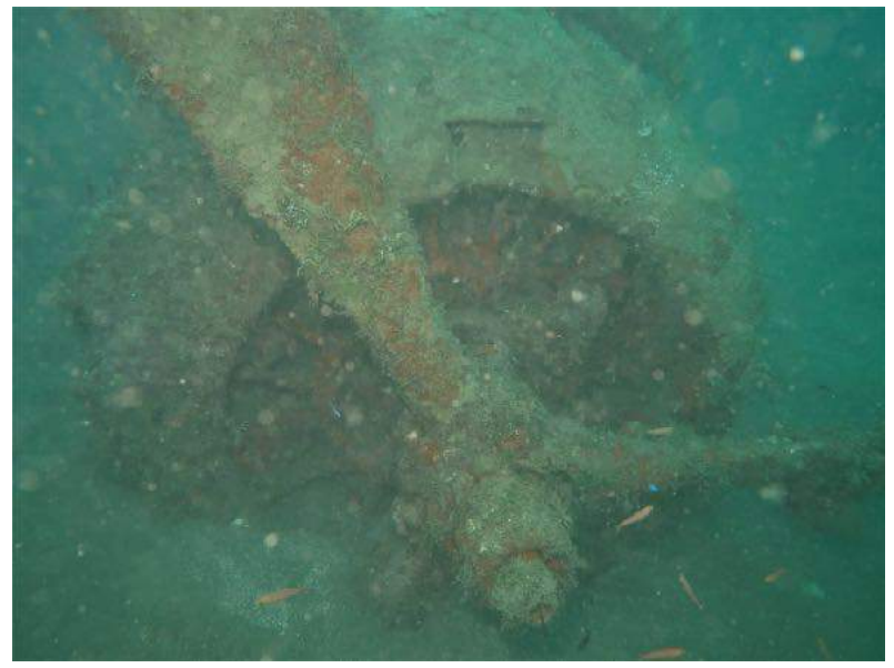
The 3 blade prop and radial engine of the SBD Dauntless resting on the muddy bottom.