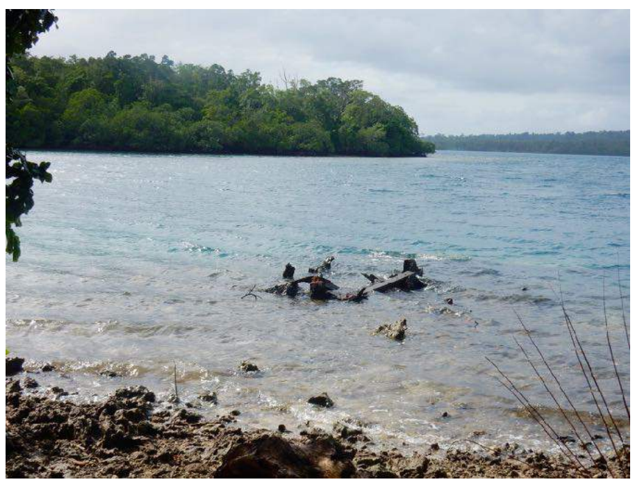
The remains of a PT Boat dock at the WWII repair and docking facility at a lagoon on the south side of Pao Island

PT Boat berthing and repair area, the US Naval hospital and the trash pile on Pao Island. This we did with him over two separate days. It always pays to ask these kind of questions or you will miss many interesting sights! Photos are below.