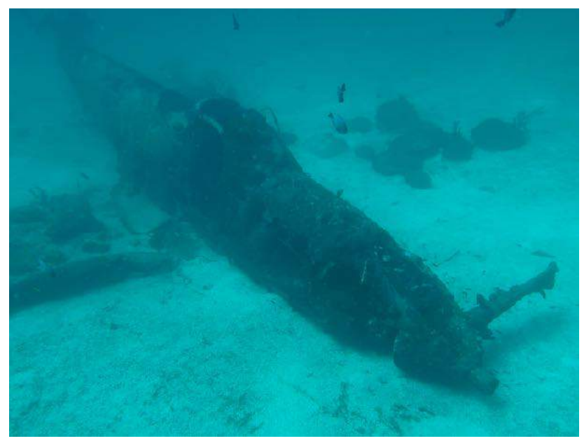
The P-39 was a very capable Army Air Corps fighter with an inline inverted V engine and three blade prop