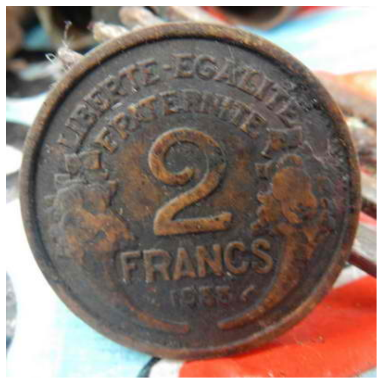
Old French Coin dated 1933!

Everywhere we went in the village, we were followed by a gaggle of kids.