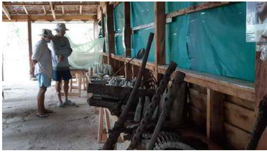
Various weapons and other relics.