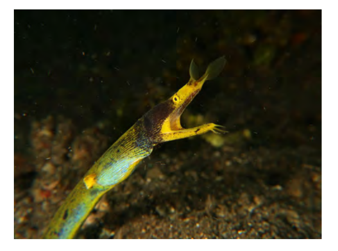
A Juvenile Ribbon Eel