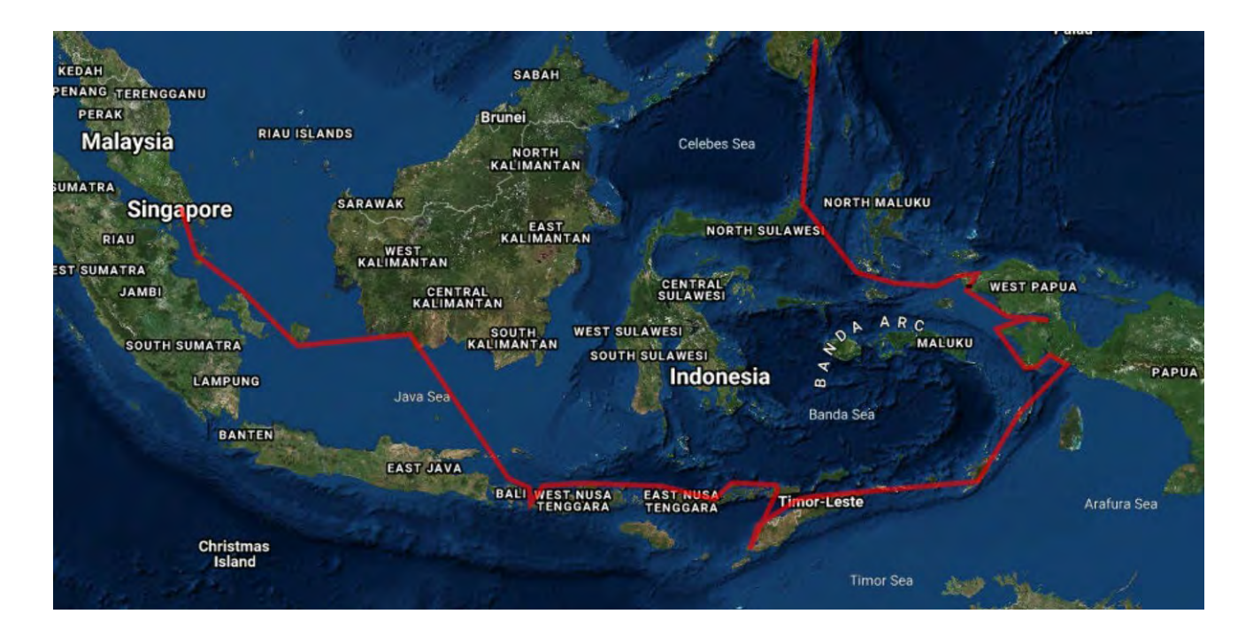
Our planned route for 2022

From Triton Bay, we must sail south to Tual, in the Kai Islands in the SE corner of Indonesia to extend our visas. Once the paperwork is finished, we plan to cruise west through the Tanimbar Islands, Timor, Flores, Lombok, Bali, Java, South Borneo and Sumatra to Singapore.