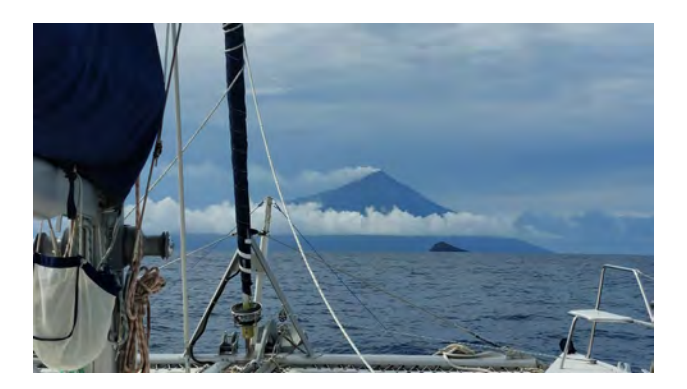
The Ruang Volcano Smoking in the Distance

Gulf, through Sangihe Island and all the way to Sulawesi. Sarangani offers at least 4 good anchorages and is a favorite stop for cruisers on their way south. We also anchored overnight at Kawio, Sangihe, and Ruang along the way, but did not venture ashore as we were not yet checked into Indonesia. This is pretty cruising grounds because islands are volcanic in origin, and at least one volcano is still smoking.