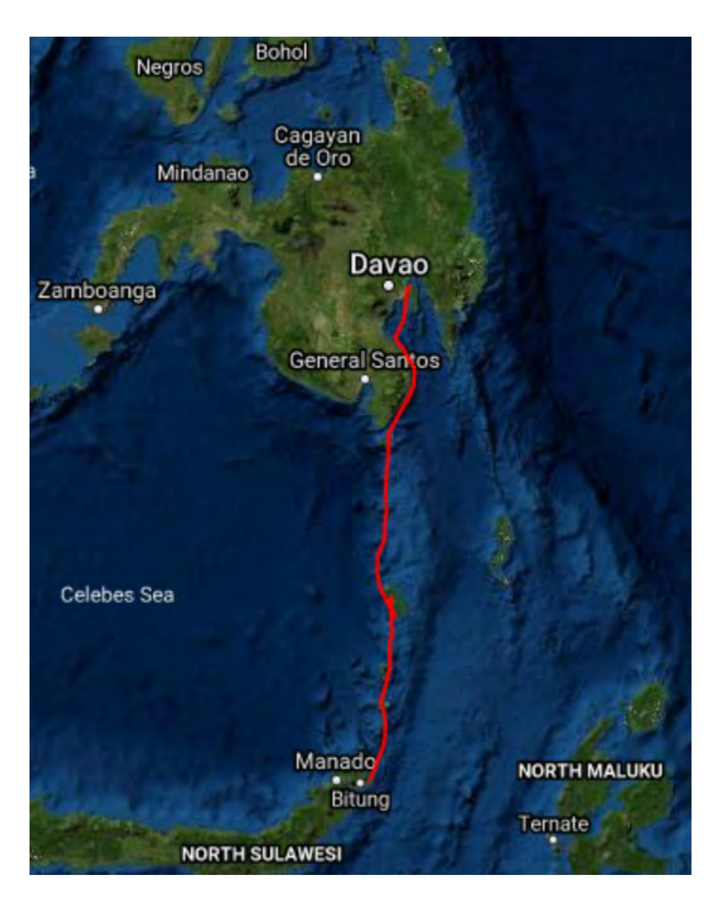
The route south from Davao, Philippines