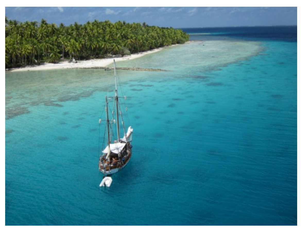
The anchorage at Suwarrow, in the Cook Islands--off Tom Neale's dock

A Compilation of Guidebook References and Cruising Reports