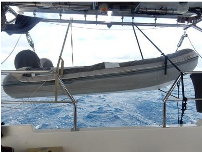
10.5' AB Lite dinghy riding underway on high catamaran davits- note high bow, chaps, wheels and polypropylene painter with snap hook.

Not all RIBs are created equal, but they all must be kept properly inflated for long life. Floppies die quickly. Which is best, Hypalon (Neoprene/CSM since 2010) or PVC, is a difficult question with many variables, see http://inflatableboatworks.com/?p=1796 For use in the tropics Hypalon RIBs seem to last longer, but I have also seen a 20 year old quality PVC RIB. In any case it is best to buy from one of the quality big RIB manufacturers like Apex, Avon, AB, Carib, or Zodiac. For boats with 2-3 crew we think that a 10.5' RIB is the perfect size; big enough for crew and dive gear, yet not too heavy to be lifted aboard when necessary. The better designs will plane efficiently with a modern 15 HP outboard with 4 persons aboard or two with dive gear. A properly designed fiberglass bottom with a good V at the bow and flatter stern section greatly enhances planing capability. 17" tubes, a 'floor pushed forward' design and uplifted bow gives more room inside and a smoother drier ride. We currently use a 10-year-old 10.5', 120 lb AB Lite RIB with fiberglass bottom and find it to be excellent