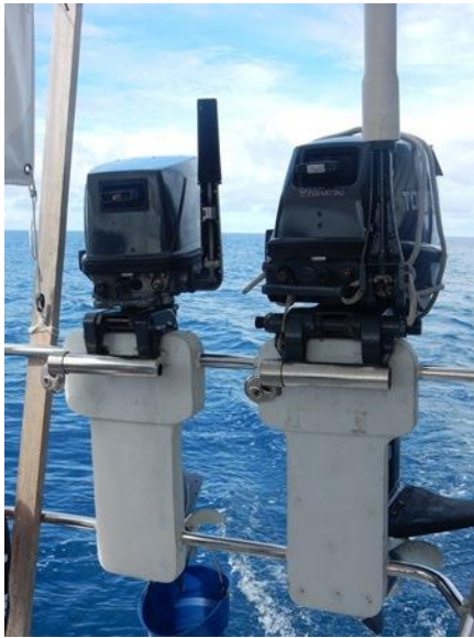
5 Nissan & 15 HP Tohatsu outboards- note Abus SS locks, and fins, lifting strap and throttle extension on Tohatsu.

Having two outboard motors of different sizes allows use of a motor that more closely matches its intended use. The other provides a backup. Because the 5 HP uses about 1/3 the fuel of the 15 HP, we use our 5 HP most of the time for short runs. The larger 15 HP is used for longer faster runs as mentioned above; still the 5 HP will plane our RIB with one person aboard. Being of the same make, they both use the same fuel tank and hose fitting. We carry lots of spares, especially rubber parts for the fuel systems, and the attachments to fresh water flush them if stored for more than a week. Line can be used to rig a simple lifting sling around the motor, and one 1.5" schedule 40 PVC pipe piece with one expanded end makes a good throttle handle for extension both motors. Cavitation fins on the 15 HP help getting on a plane with heavier loads. To prevent theft, we use custom stainless steel clamp tubes with round Abus locks.