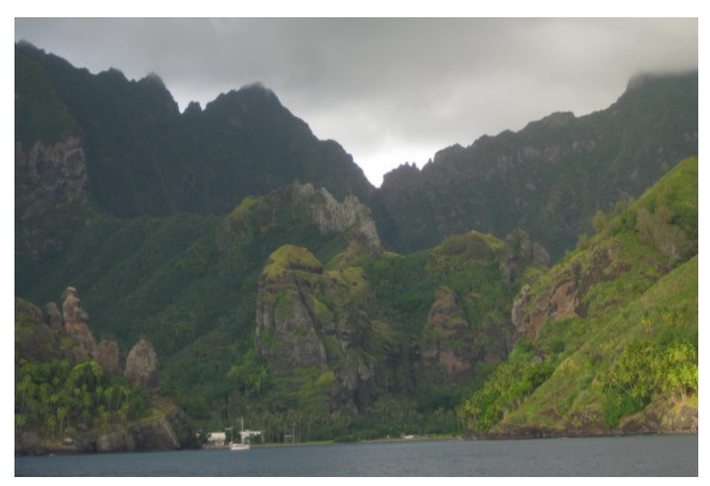
Figure 1 Bay of Virgins