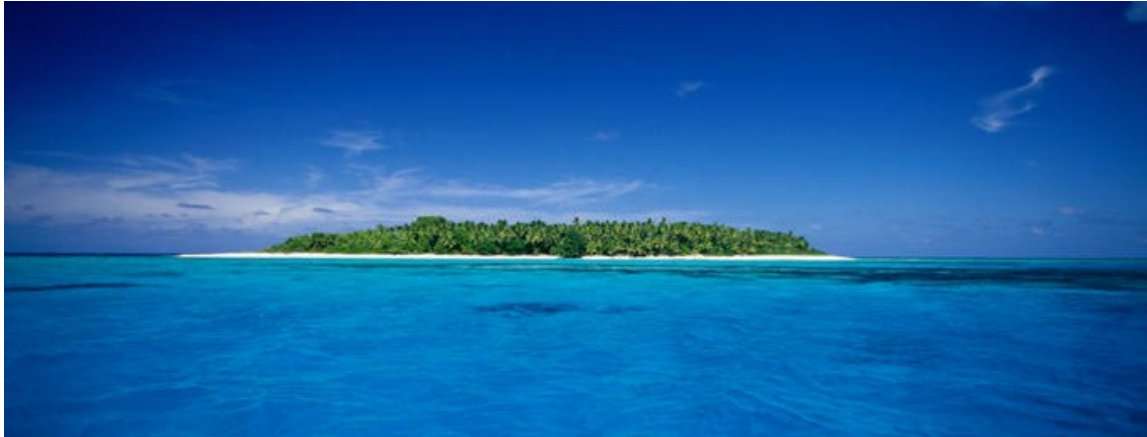
Tepuka Islet - Tuvalu

Wallis, Futuna, Rotuma, Tuvalu (Funafuti), Kiribati (Tarawa) and Outer Islands