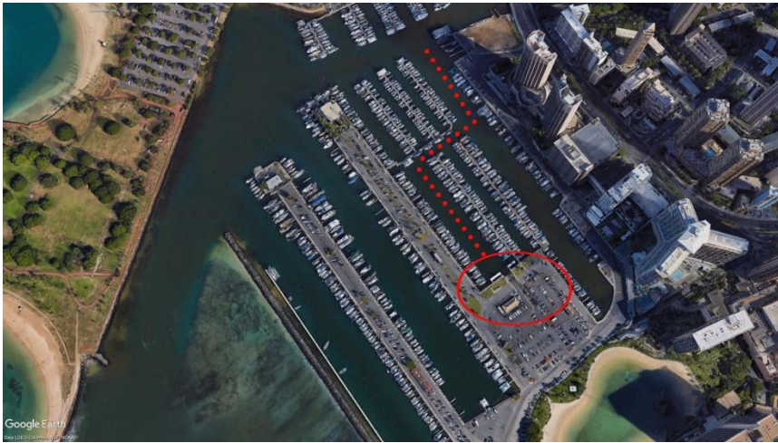
Harbor Master's office and inspection docks