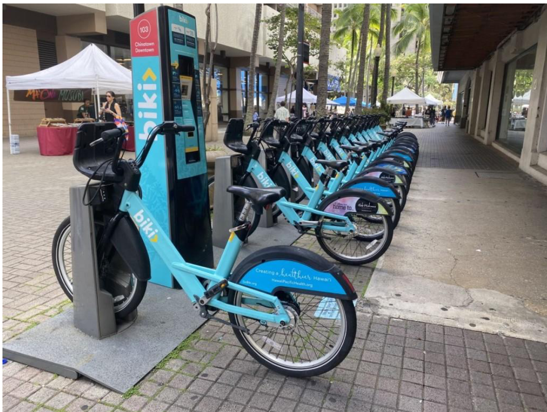
Biki Rack in Waikiki

I found Biki rental bikes to be the best option for getting around. You can get a monthly pass called the "Voyagers Pass" Kama'aina (this means resident) for $25 a month. I signed up for this and they didn't ask for a local address but if they did just use the address from the Prince Hotel or the Harbor Master's office. There are tons of the bike racks all around Waikiki and you can just ride across town and lock it up at one of the racks then do your errands and go unlock another bike to return. All this is done using an app. Very simple and I more than got my money's worth.