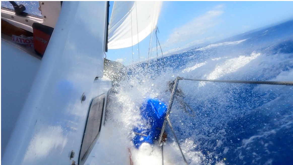
Triteia during a lively sail across the Kalohi Channel