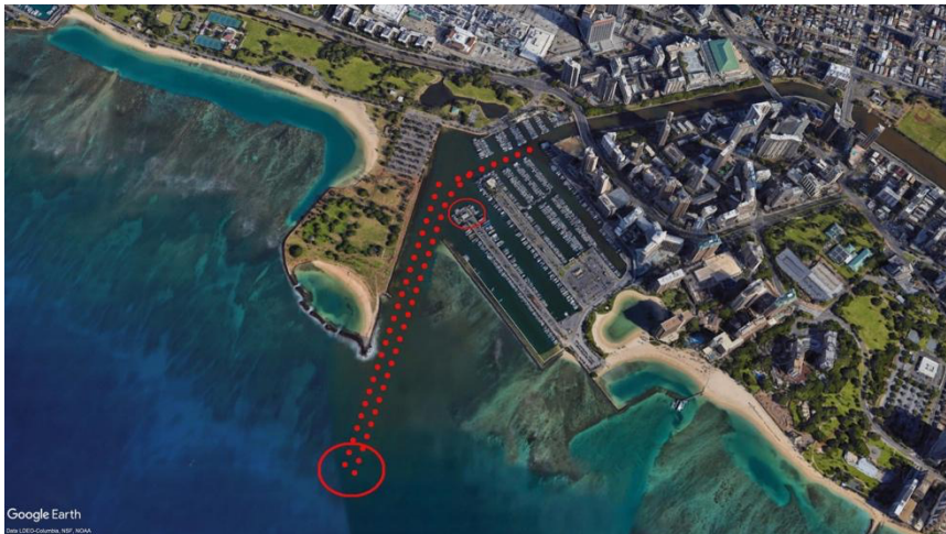
Buoy Run + "Old Fuel Dock"