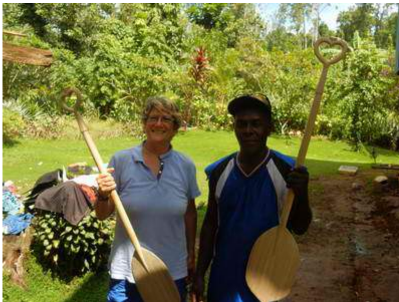
And we bought a Souvenir