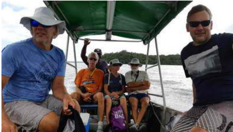
The Gang enroute to the Canoe Carver's Abode