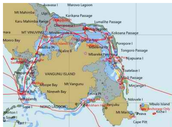
Our Tracks (Red Lines) through Marovo Lagoon Note lack of detail on chart!

The below cruising summary is extracted from the blog of s/v Soggy Paws . It covers 3 different periods cruising in the fabulous Marovo Lagoon, located in the SE corner of the New Georgia group of the Solomon Islands in the western Pacific. It is not an easy area to get to especially for Milk Run circumnavigators or even those who have time and the finances to otherwise cruise in that area. It is located in the southeast corner of the New Georgia group, about in the middle of the Solomons north and south. All commercial charting is mostly worthless as they lack accuracy and shoreline/reef detail. So we prepared satellite imagery of the area in advance and used that with OpenCPN to provide the accuracy and detail we needed. Sherry's Solomons Compendium, available under the Destinations menu on the SSCA website or on our website, now has waypoints and information on most of the possible stops in the lagoon.