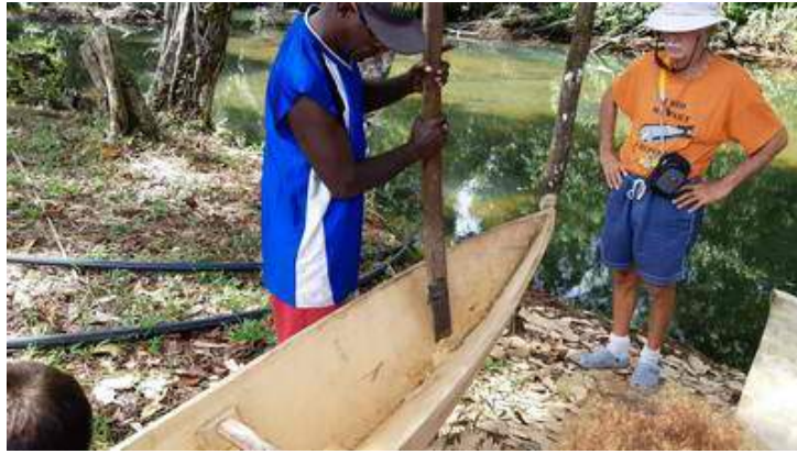
Shaping the Canoe