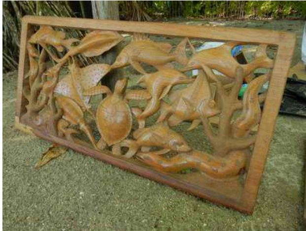
A Wall Hanging of the "Spirit of the Solomons" Style

Many carvers also had "Spirit of the Solomons" carvings, depicting the many facets of Solomon Islands life. Some were carved as wall hangings and some as stand-up statues.