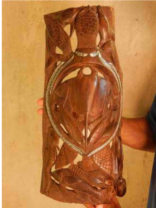
One of Rocky's "Spirit of the Solomons" Carvings

The next day we moved 2 miles east to Cheke Village. A couple of the Cheke carvers had come out to visit us in their canoes when we were anchored at Lumalihe Pass, and we had put them off then by saying "We'll come visit your village later." "Later" came quickly and as soon as we dropped our anchor, visitors came by in their canoes.