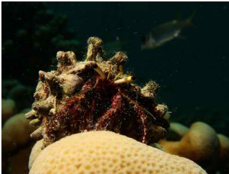
Great Shot of a Hermit Crab