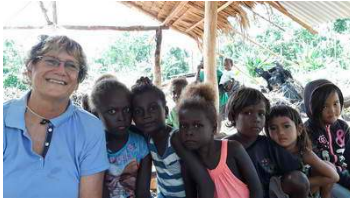
Everyone Wants Their Picture Taken