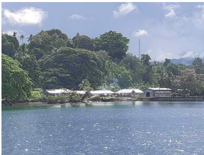
The Non-Descript town of Seghe