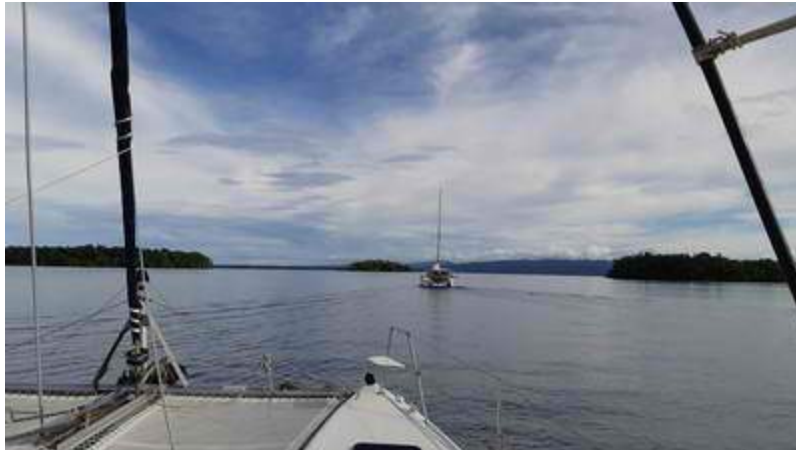
Following Indigo on our First Foray into Marovo Lagoon

We had been hearing about Marovo Lagoon ever since we had a "Tell us about the Solomon Islands" session with cruising friends in Palau in 2014. We were finally there, and in 3 visits during April, May, June, and July, we thoroughly explored the entire lagoon area.