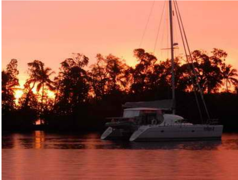
A Gorgeous Sunset

We never stopped at Matikuri again, as we found the anchorage pretty buggy with small black flies, not “mozzies” (Mosquitos).