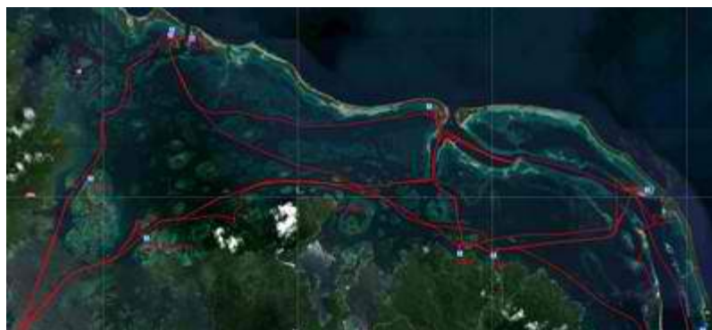
Our Tracks (Red Lines) on the N side of Marovo Note all the reef areas!