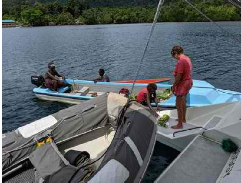
Veggies for Sale!

They are quiet and respectful but very canny in their dealings with visiting yachts. We had trouble saying "no" even when we had acquired way too many carvings or didn't need any more veggies. But it is exhausting having visitors stop by.