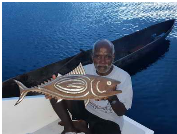
One we didn't buy, that we wish we had

The final stop on our first pass through Marovo Lagoon was a village called Mbili. (pronounced Billy with a short “mm” sound at the beginning of the word). The actual village is on an island just outside the main lagoon rim. But the anchorage is inside the pass, next to a small dive operation called Solomon Dive Adventures. Lisa has been running a dive operation in Marovo for a bunch of years, but has moved locations several times. She is current located on a Tambapeava Island, just inside Mbili Pass.