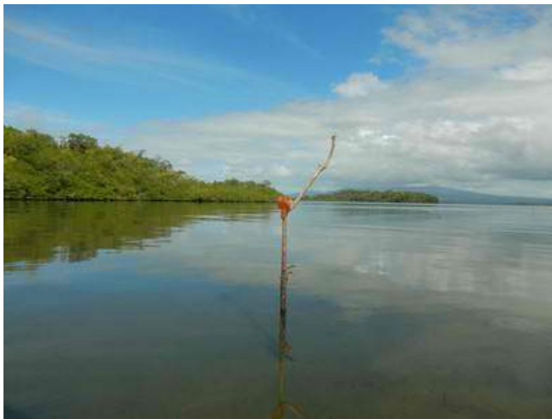
The Channel Marker for the River Entrance