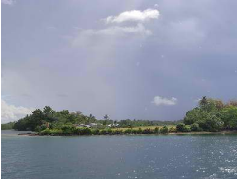
The Seghe Airport (A Grass Strip)

We were surprised to find pretty good cell coverage in Marovo. A few places had only a glimmer of a signal, but most places, if we got our phone up high, we had enough signal so that we could do light internet, using our phone as a hotspot. The only challenge was keeping credit on the phone. For some reason, the Solomons Islands are excluded from the countries that our online topup site would work with (Ding.com and associated Ding app). Ding has worked in Malaysia, Thailand, Cambodia, Philippines, Indonesia, and Papua New Guinea, but it doesn't work in the Solomons. That meant we had to find someone who could sell us top-up. Sometimes we had to give money to someone with our phone number written on a piece of paper, and they would hike to the next village and purchase credit for us from a tiny store that had both My Telekom credit, and signal.