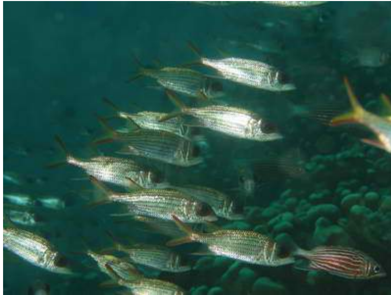
A Large School of Squirrelfish