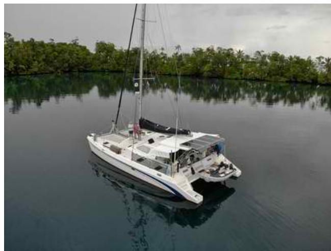
Our Anchorage at Matikuri

Our first stop was Matikuri, where we'd had a number of reports of the Matikuri Lodge and it's welcome from other cruisers. Sadly, the driving force behind Matikuri Lodge had passed away a few years earlier, and the rest of the family fumbled the ball. A few bad reports on Trip Advisor from disappointed tourists, plus new logging activity in the area, and it was barely operating. They did have 2 guests while we were there, and we managed to get them to make us dinner one night. And we hired them to take the 7 of us to snorkle the small boat tunnel to the WNW of Matikuri Lodge.