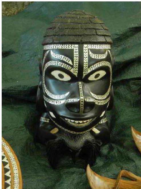
A Muzu Muzu Carved out of Ebony

Nearly every carver had Muzu Muzu's for sale. These were traditionally mounted on the bow of the war canoe, and when the canoe was going out to collect heads, the man had a skull in his hands (this one has a bird, which signifies peace).