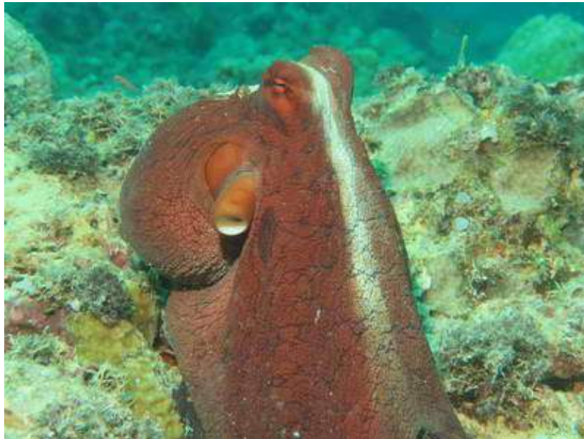
A Very Curious Octopus

The dive is called "Pipes" it's terrain is so-so, but the "critters" were pretty cool. We encountered 2 big, friendly octopi, and a bunch of other smaller critters.