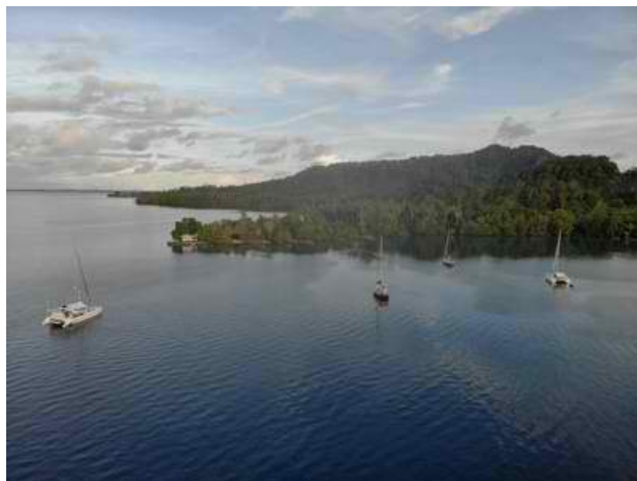
A Drone Shot of our Fleet at Cheke Village

The next day we moved 2 miles east to Cheke Village. A couple of the Cheke carvers had come out to visit us in their canoes when we were anchored at Lumalihe Pass, and we had put them off then by saying "We'll come visit your village later." "Later" came quickly and as soon as we dropped our anchor, visitors came by in their canoes.