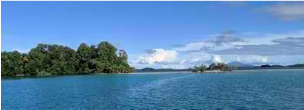
Pore Pore Anchorage

The final stop on our first pass through Marovo Lagoon was a village called Mbili. (pronounced Billy with a short “mm” sound at the beginning of the word). The actual village is on an island just outside the main lagoon rim. But the anchorage is inside the pass, next to a small dive operation called Solomon Dive Adventures. Lisa has been running a dive operation in Marovo for a bunch of years, but has moved locations several times. She is current located on a Tambapeava Island, just inside Mbili Pass.