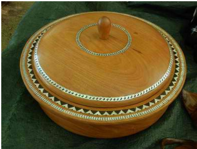
An Exquisite Bowl with Shell Inlay

We did enjoy the weekly carver's display at Uepi. The resort permits all the local carvers to come one day a week to exhibit their carvings. They are strictly regulated by the resort as to negotiating tactics, etc, so as not to bother the guests. This is a great place to see all the best carvings in one spot. But because it is held at an upscale resort, the prices that the carvers are asking tend to be fairly high.