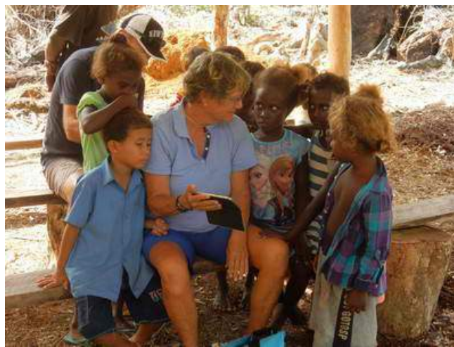
Checking out their Pictures on the Smartphone