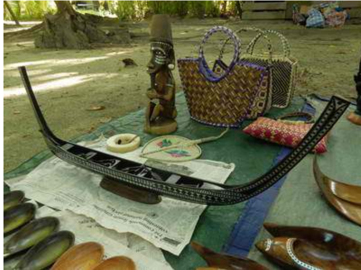
Several Items Including an Ebony War Canoe