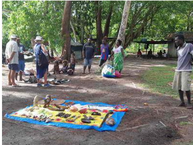
The Mbili Carving Show