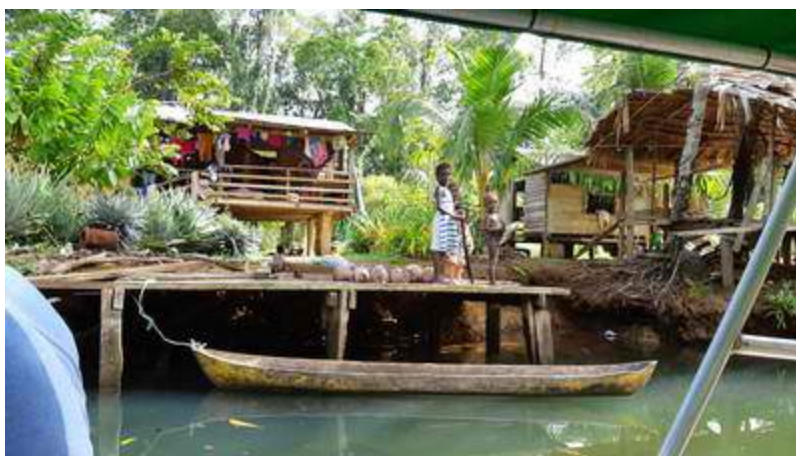
At the Canoe Maker's Village