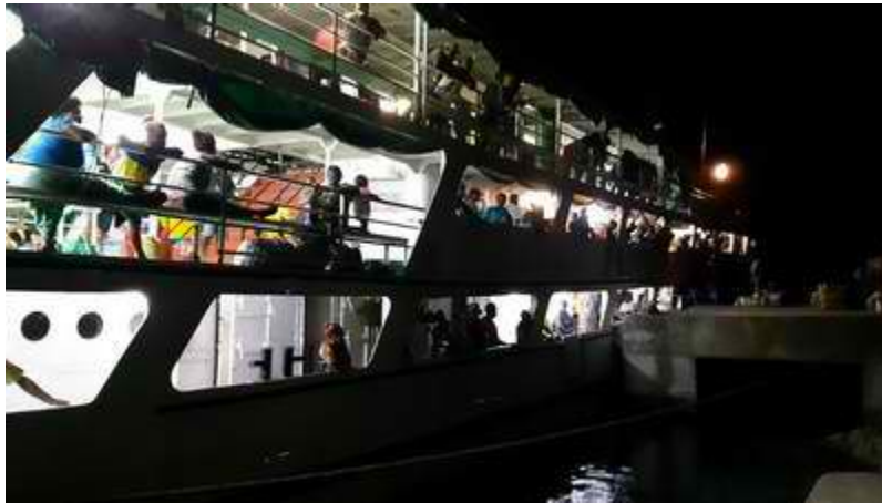
One of the Weekly Honiara to Gizo Ferries

There are two weekly ferries that transit Marovo Lagoon in both directions, they leave from Honiara and go to Gizo, making several stops in the Lagoon, including a stop near Mbili, and also at Seghe. They turn around in Gizo and head right back to Honiara. It would be a cool way to see a good cross section of the Solomon Islands.