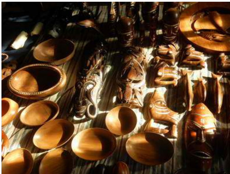
A Collection of Some of Rocky's Carvings