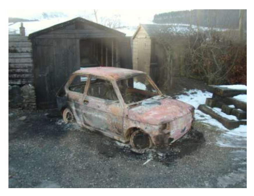
See: <a href="http://www.batteryvehiclesociety.org.uk/forums/viewtopic.php?t=1825">http://www.batteryvehiclesociety.org.uk/forums/viewtopic.php?t=1825</a>